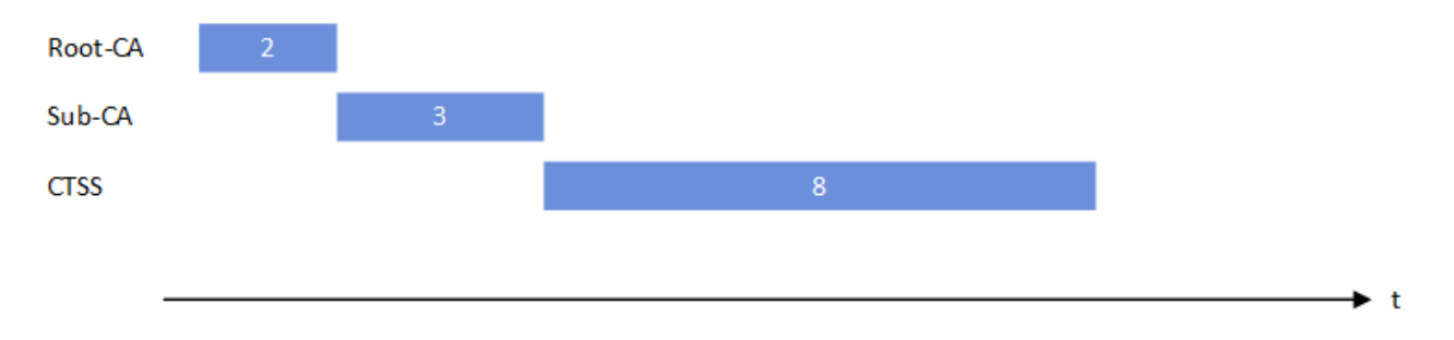
Figure 1 Exemplary private key usage periods in years, when certificates are issued as late as possible

In the following an example for the determination of the validity period of the public keys is given such that the validation of digital records is enabled for at least 10 years as of the end of the fiscal year beyond the lifecycle of the TSS certificate. Assume that the private key usage periods for issuing certificates and signing digital records are instantiated such as depicted in Figure 1. Thereby, the dark blue bars represent the private key usage periods for issuing digital records for TSS.